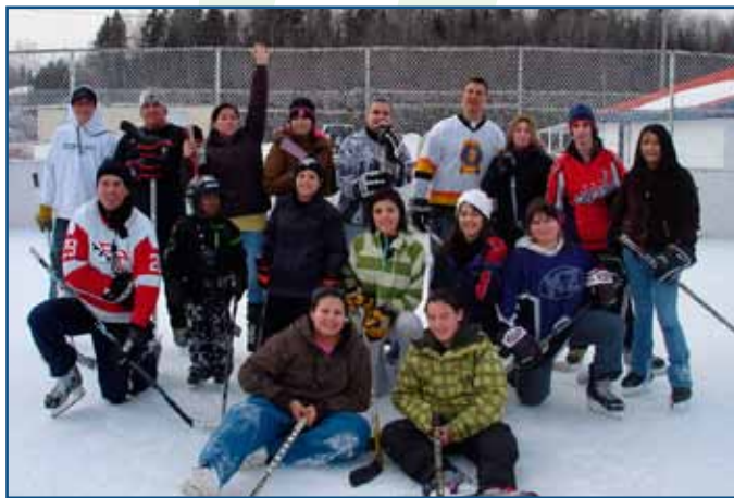
Sports are a huge part of our students' life at KZ School!